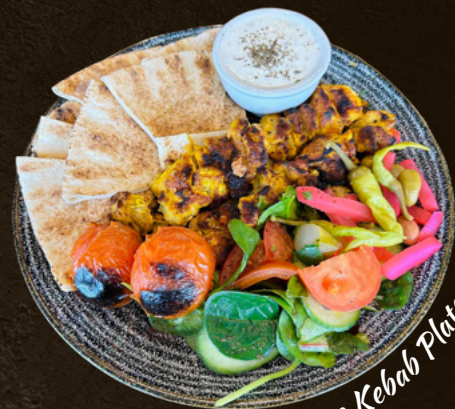
2 Choice Kebab Plate

Chicken Tawook, Thigh Chicken, Kafta, Lamb