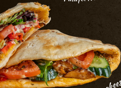
Sumac Chicken Manakeesh