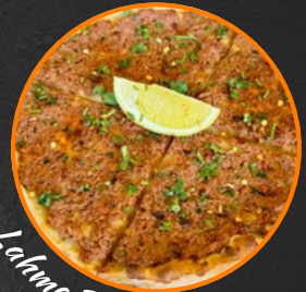
Lahme Bi Ajeen