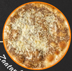
Zaatar & Cheese

Kaak Bi Jibun $8.90 Seaseme seed incrustated manakeesh filled with 3 cheese Jibun mix