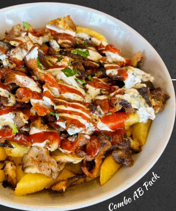
Combo AB Pack